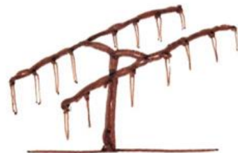
geneva double curtain