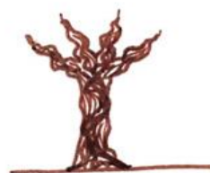
goblet / head